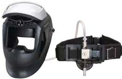
3M™ Speedglas™ 9000 FlexView Welding Shield with Fresh-air C

For highly-contaminated welding environments, you need the Fresh-air C (Compressed air) respirator system with a nominal protection factor of 100+. The lightweight, belt mounted regulator allows the user to adjust the airflow from 170 to 300 litres per minute, making Fresh-air C ideal for hot and strenuous work. For extremely hot or cold environments the user can replace the regulator with a Vortex personal air conditioner (see overleaf). The Speedglas systems are approved to AS/NZS1716 for respiratory protection and AS/NZS1337 & AS/NZS1338.1 for eye and face protection.