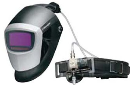
3M™ Speedglas™ 9000 Welding Shield with Fresh-air C

Ergonomic welder protection for highly contaminated environments. User-adjustable airflow from 170 to 300 l/min.