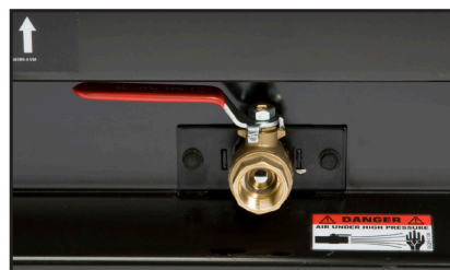
Air shut off valve