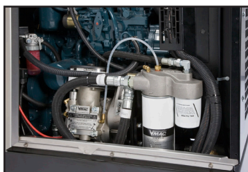
VMAC® Air Compressor